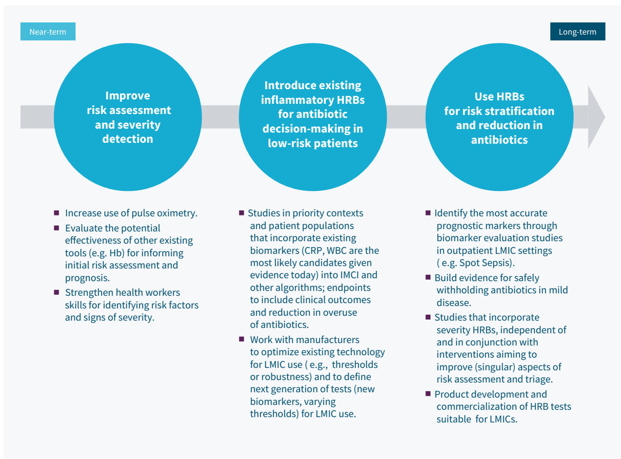
Figure 3: Approaches to advancing near- and long-term opportunities

There is also scope for existing technologies in POC format to play a role (e.g. hematology analyzers) in risk triage and antibiotic prescribing. In the future, as more evidence becomes available on both novel biomarkers and on withholding antibiotics, an approach that uses HRB for risk stratification and reduction in antibiotics might be possible.