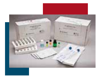
Figure 5: OncoE6 Cervical Test

Highlighted below is the most widely available biomarker test that is suited to more decentralized testing in LMIC.