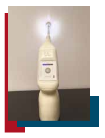
Figure 14: Thermocoagulator