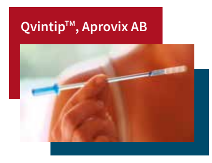
FIGURE 6 Examples of self-collection devices for HPV testing

The self-collection process follows similar steps for the majority of products: 1) insert swab/ brush into the vagina and gently rotate for 10-30 seconds, 2) remove swab/brush and transfer it into the collection tube, 3) snap off swab/brush shaft and cap the collection tube, 3) discard shaft, and 4) label collection tube and transport sample to laboratory. Once in the collection tube, specimens are stable at room temperature for at least 24 hours and some for more than 30 days. For the most part, the self-collection process is acceptable to women and perceived as discreet, private and time-saving. The process is described by participants as femalefriendly, painless and quick.