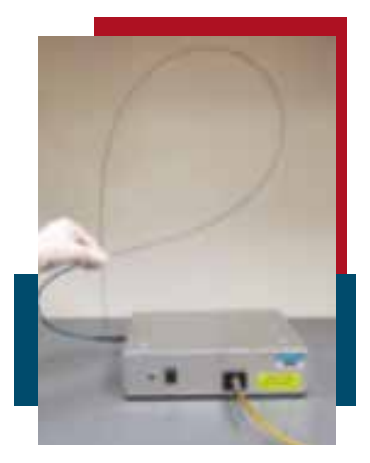
Figure 9: HRME