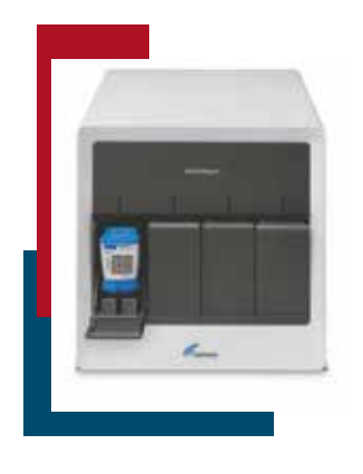
Figure 3: Cepheid Xpert © Cepheid

New point-of-care (POC) HPV tests are coming into the market and are intended for use in LMICs. These HPV tests are intended to be portable and simple to operate, so that they may be performed at clinics and primary care centres rather than at centralized laboratories, by personnel with minimal technical training.<sup>15</sup> Two near POC tests have currently received WHO Prequalification.