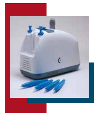
Figure 12: Cryopen © CryoPen Inc

developed in collaboration with Jhpiego, a John's Hopkins University-affiliated NGO, aims to replace traditional cryotherapy devices to increase access and reduce the cost per treatment. This device uses about 1/10 of the amount of gas used in traditional cryotherapy. CryoPop is currently undergoing clinical evaluation.<sup>32</sup>