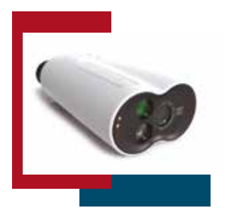
Figure 7: Gynocular

Colposcopy is a procedure that provides a magnified and illuminated view of the vulva, vaginal walls, and cervix. Colposcopy is used to visualize the epithelial (surface) layer and underlying blood vessels and is generally performed when the Pap smear or the cervix appearance is abnormal. Colposcopy testing involves acetic acid wash, use of color filters and is used to define the location for taking biopsies and for directing treatment of cervical pre-cancer.