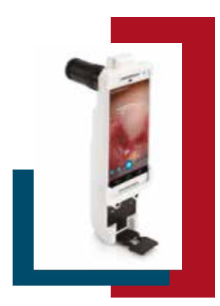
Figure 8: EVA System © MobileODT Ltd.,