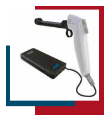
Figure 13: C3 Mobile Thermocoagulator