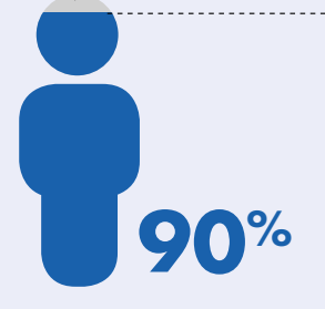
reduction in TB incidence rate by 2035

reduction in the number of TB deaths by 2035