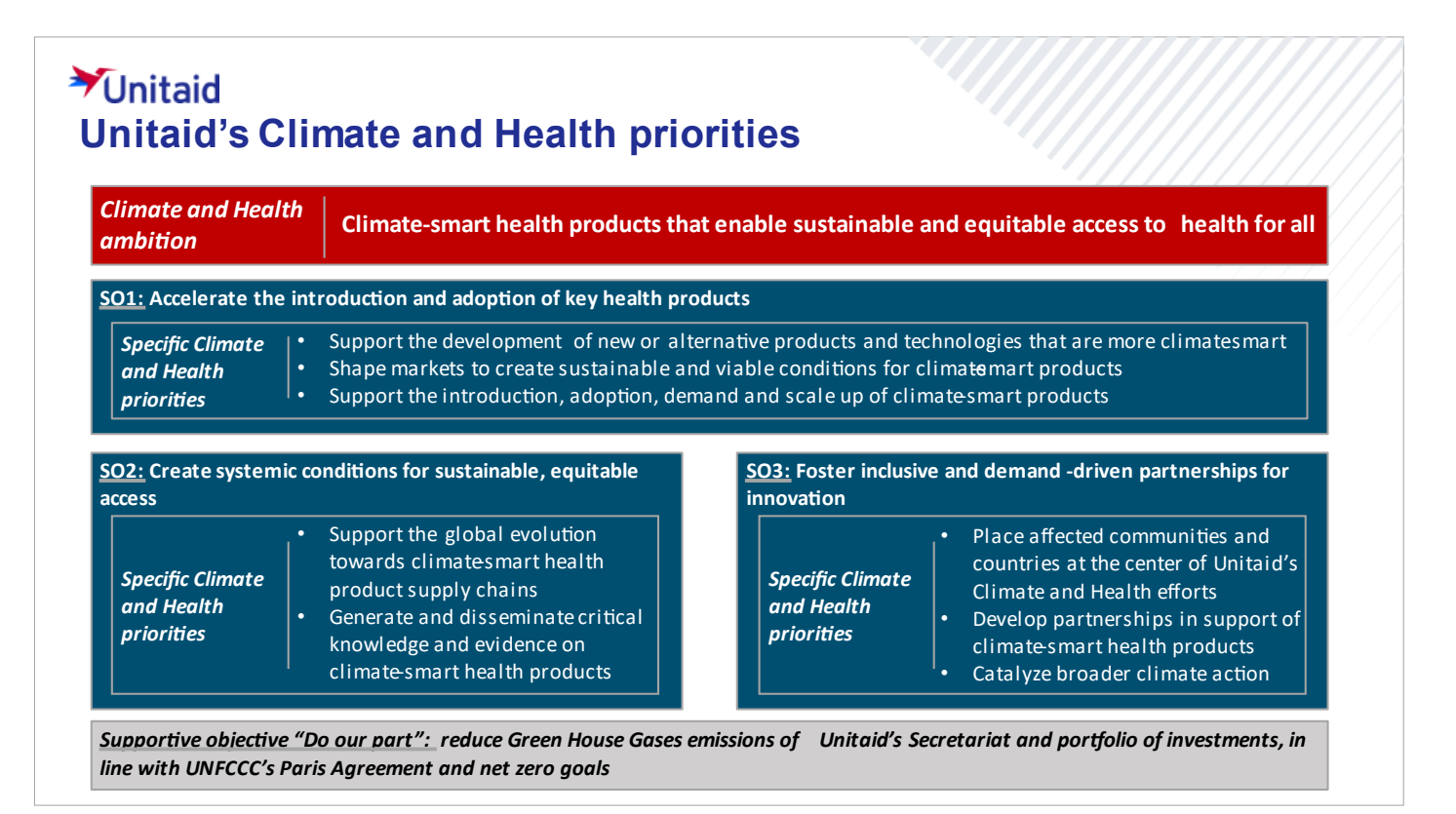
Figure 2 - Unitaid's Climate and Health priorities

These specific priorities cut across Unitaid's existing model and are framed in the context of each Strategic Objective (SO) of the 2023-2027 Strategy in Figure 2.