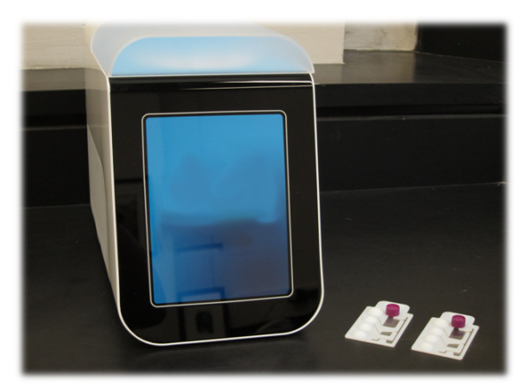
Figure 3. NWGHF RT-PCR Testing Platform.