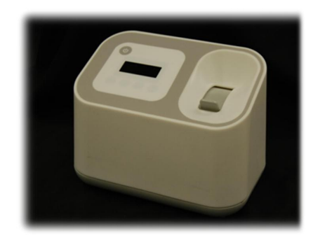
Figure 4. NWGHF EID Platform.

Clinical and field trials of the NWGHF ultrasensitive p24 antigen rapid lateral flow assay for EID at the point of care are still expected to be conducted in 2011, with availability of the device in late 2011 or early 2012. An updated image of the device is shown in Figure 4.