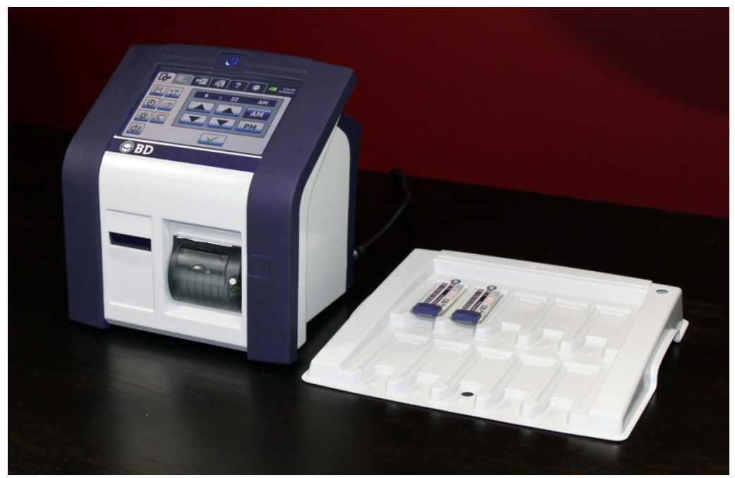
Figure 1. POC CD4 Device from BD Biosciences.

The sample is collected from the patient using a fingerstick or an EDTA tube. The cartridge is selfcontained and is inserted by the operator into the device. After a short incubation period, detection takes place automatically and the result can be read immediately in a single, easy step. The new and innovative cartridge technology contains dried reagents and requires no-cold chain, which enables longer shelf life over a wide range of environmental conditions. Market launch is expected in late 2012.