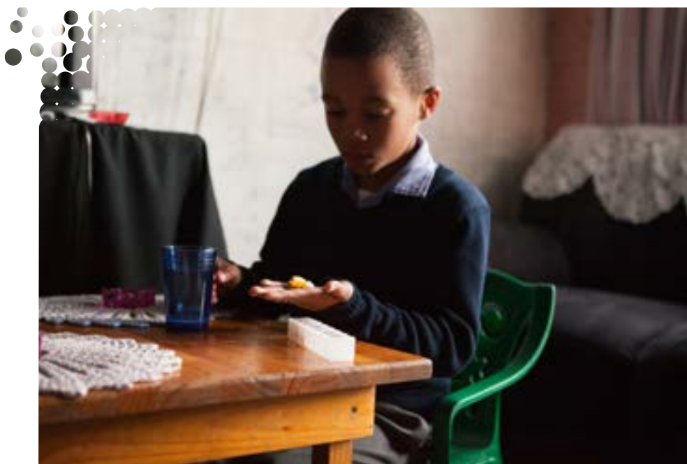
A child living with HIV in Cape Town, South Africa, takes his antiretroviral treatment.

The Global Fund, leveraging its scale and competitive tender process, aims to secure the lowest sustainable pricing and expand access while maintaining a healthy supply base. This work is part of a broader effort that allows people in low- and middle-income countries to access best-in-class treatments in record time and at affordable prices. For example, TLD, an antiretroviral treatment in one pill that combines three medicines (tenofovir disoproxil fumarate, lamivudine and dolutegravir), can now be offered for under US$45 per person, per year for the first time. This improved pricing – a 25% reduction – will allow governments in resource-limited settings to expand access to critical HIV services.